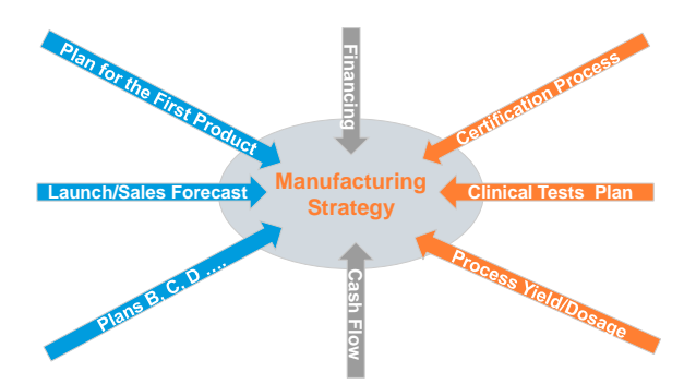
Figure 1 - Manufacturing Strategy - Critical Information

The logical balance between the enthusiasm of Sales, the skepticism of Finance, the drive of R&D and the conservative approach of Operations (to ensure product is timely delivered) is an "Executive Function " with positive impact in the plant design, construction and expansion.